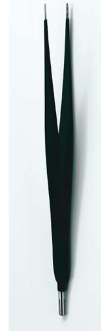
DIA-021 Diathermy Forceps

We supply re-usable Bipolar and Diathermy forceps for all specialities. We also supply leads for both types of forceps. Contact us at the number below for a full colour brochure