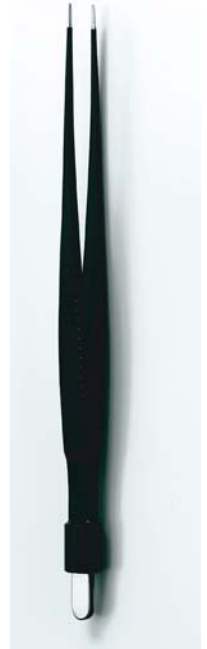
BP-200-ISF Bipolar Forceps

Examples from the wide range of cleaning brushes available