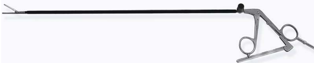
CEV 405 Johann Grasping Forceps; fenestrated, atraumatic jaw 20mm; 5mm Ø

SIGH, together with its daughter company, Caterham Surgical Supplies, are U.K. distributors for some of the leading ranges of specialist surgical instruments from around the World.